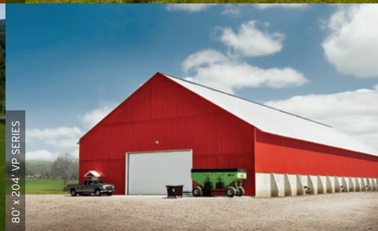
80' x 204' VP SERIES