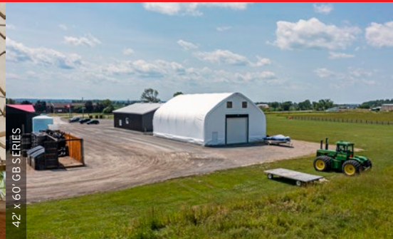
42' x 60' GB SERIES