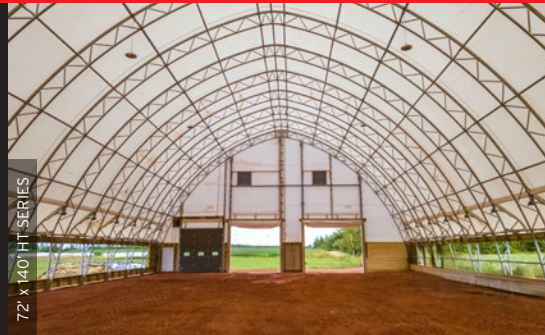
72' x 140' HT SERIES