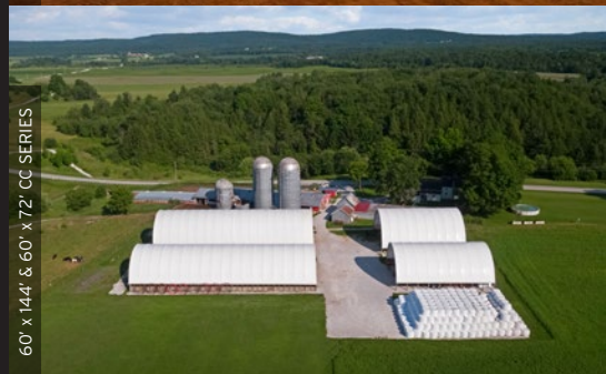
60' x 144' & 60' x 72' CC SERIES