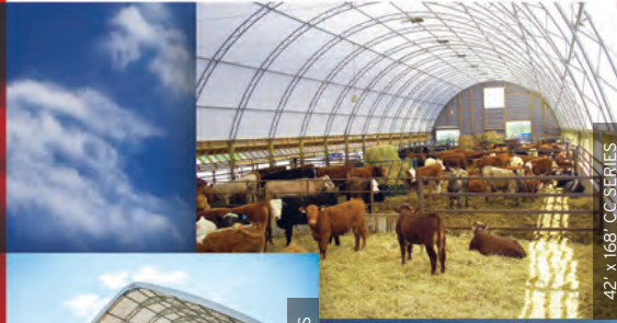
42' x 168' CC-SERIES