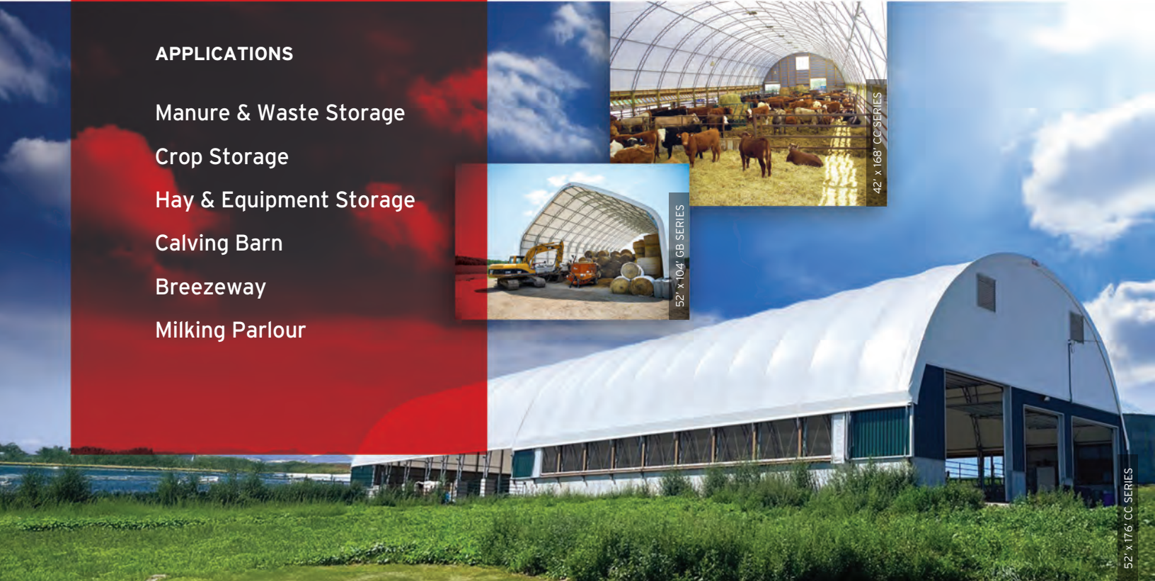
52' x 176' CC-SERIES